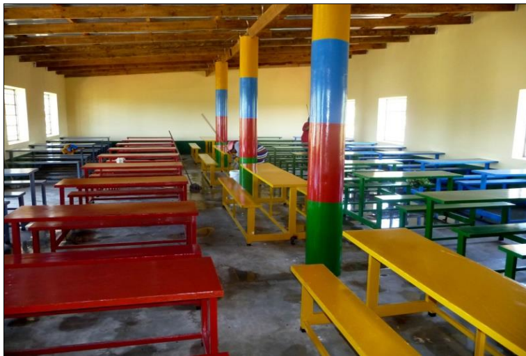
Space for 252 Children