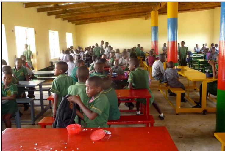
First Seated Lunch