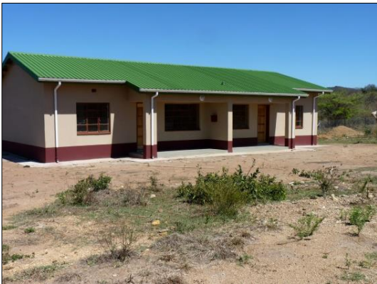
2 Teacher Houses

The personal contact in conversation with “our” children at the Sikhhandza Bantfu Primary School, the teachers, the mothers, has once again made me feel deeply humbled and at the same time strengthened that we with MEDEA e.V. are following the right approach to promote capacities in our partner community, which should ultimately limit the inequality of opportunities. The current project, the administration building at the school, is almost finished. Like everything MEDEA has built so far, the classrooms, teachers' houses, dining area for the 252 children, is built in a sustainable, stable way. The Chief - Mayor, the community and the responsible Ministry of Education show MEDEA their gratitude by a friendly welcome, a lot of laughing, singing and praying for the successful infrastructure we have implemented.