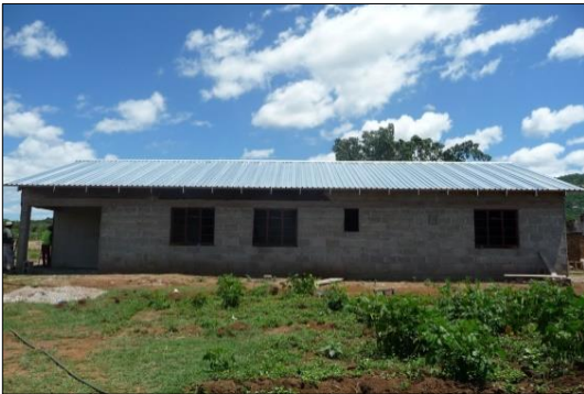
Frontview with Roofing