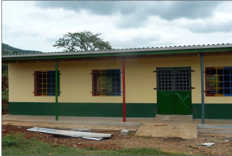
Dining-Area colourful painted