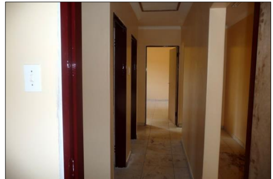
Interior View Painted