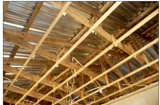
Interior View with Electricity