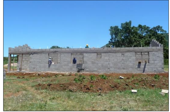
Frontview with Windows