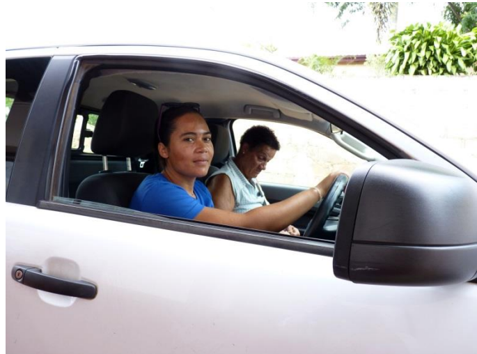
driven by Valencia