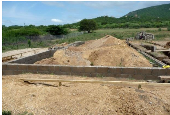
first row of stones is finished