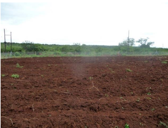
size of the garden: 50 x 50 m