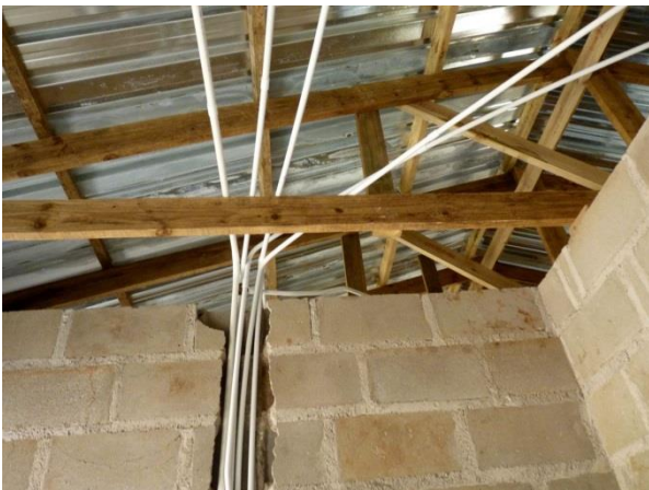
the power lines are installed

With the in 2015 installed borehole, the school has clear, clean drinking water. Septic tanks are being built at the teacher's homes, i.e. toilets with running water and a "real" shower, absolute luxury. Development - in the sense of the MEDEA philosophy. After the school has a power connection, power lines will also be laid in these houses.