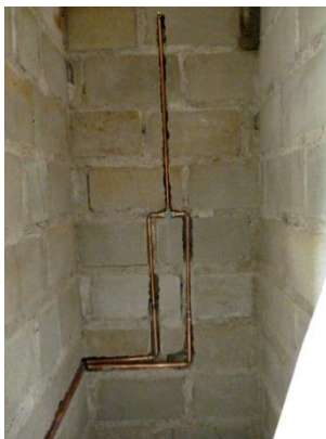
copper lines in the toilet