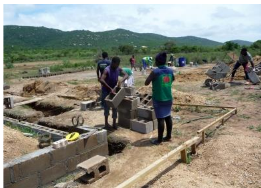
construction works at the teacher houses