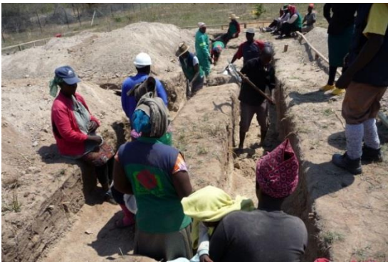
strong Swazi Women – industriously helpers

The construction work of the two teacher houses, financed with funds from the BMZ, is progressing well.