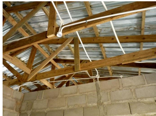
and the roof has a solid construction