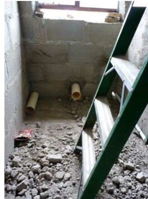
and water connection