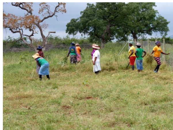
strong women power