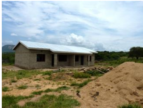
Front view with roof

With the in 2015 installed borehole, the school has clear, clean drinking water. Septic tanks are being built at the teacher's homes, i.e. toilets with running water and a "real" shower, absolute luxury. Development - in the sense of the MEDEA philosophy. After the school has a power connection, power lines will also be laid in these houses.