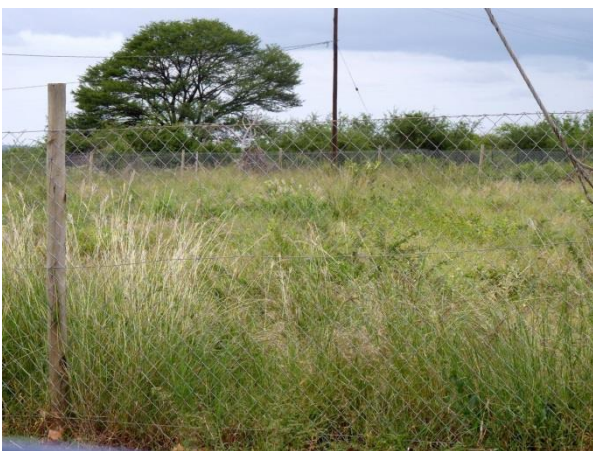
the area is fenced

The work of the women who work here day after day despite of extreme heat of 32 to 38 °C is admirable. We believe that we have not promised our donators too much about their commitment.