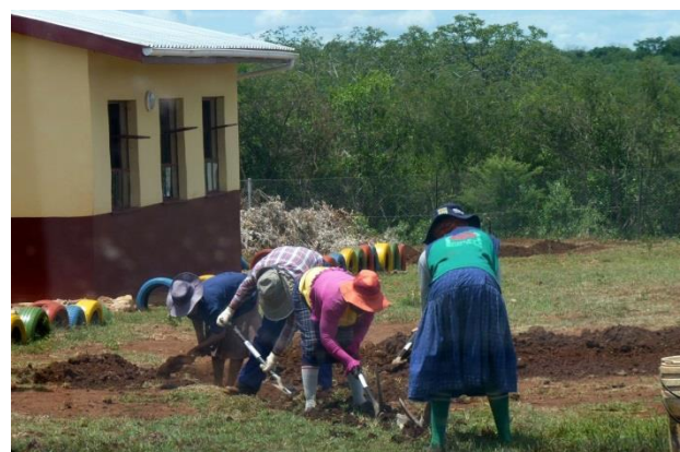
digging for the water lines