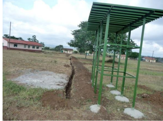
the trench for the water pipeline is pulled

After installing water tanks and installing a water pump, clear and clean drinking water is now also flowing at the Mpaka Elementary School.