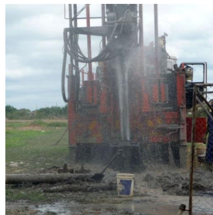
in 90 m depth we found the water