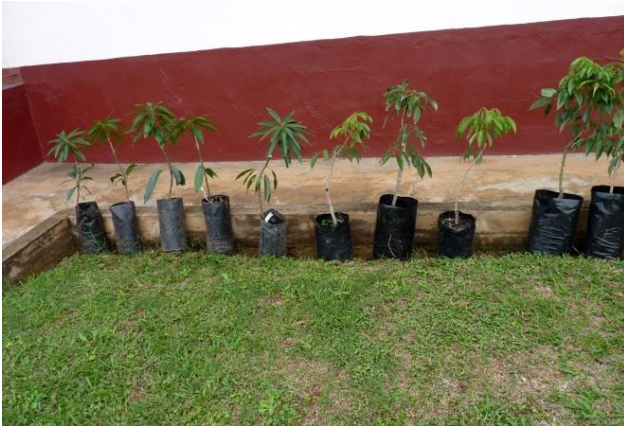
avocado, mango and lychee