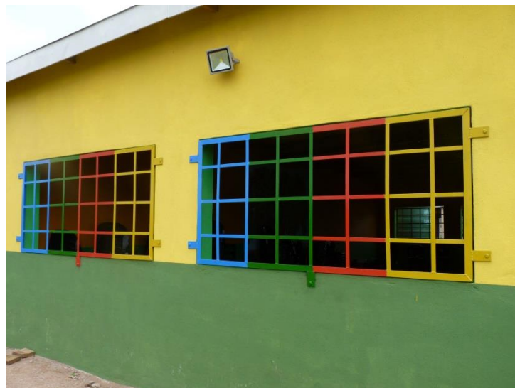
Exterior of the dining area

We can proudly say that the pre-school / kindergarden project is a "classic" development project in the sense of the lack of experience in Swaziland in early childhood education.