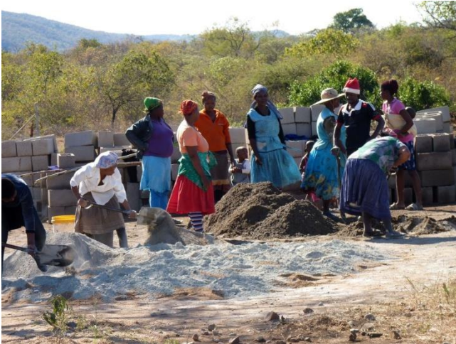
all the women's power is available