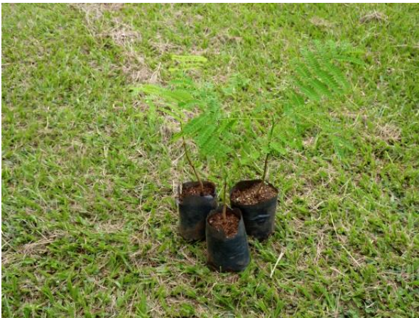
shady tree sprouts

In addition to the actual fruit trees, shady trees on the grounds should not be missing.