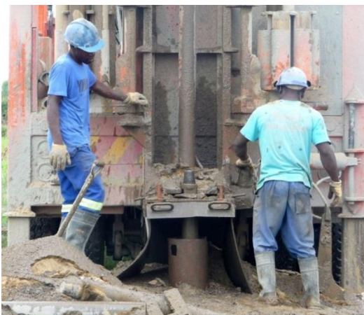
the drill is running

After inspection of the site and determination of the drilling point, the drilling was completed in December.