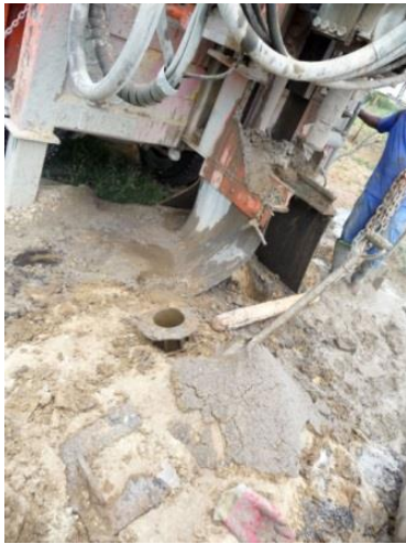
the borehole is installed