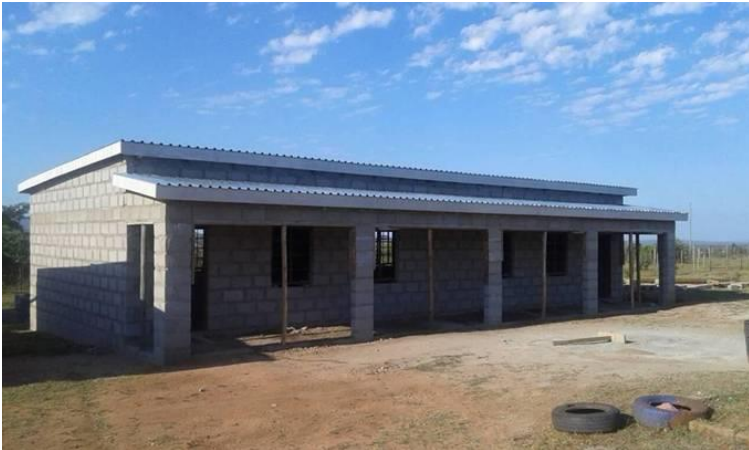
The shell of the building is complete

In Zandondo , at the end of November, we handed over the finished preschool / kindergarten to the Swazis. The project promises a lot of sustainability. The demand for a kindergarten place also comes from the surrounding communities. 58 children are already registered for the current school year.