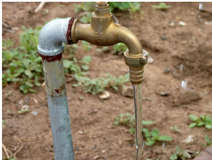
Clean and clear drinking water

After installing water tanks and installing a water pump, clear and clean drinking water is now also flowing at the Mpaka Elementary School.