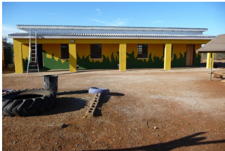
And it's looking great after the painting

Even inside, the walls are not just painted, but painted beautifully, so that the children have their joy.