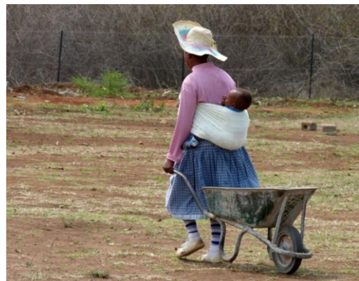
even the little ones are always there