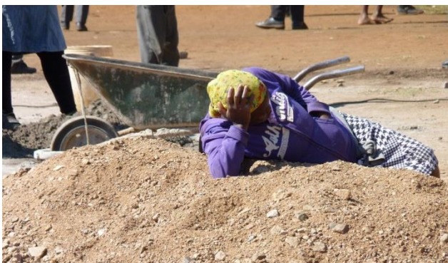
an occasional nap is also included