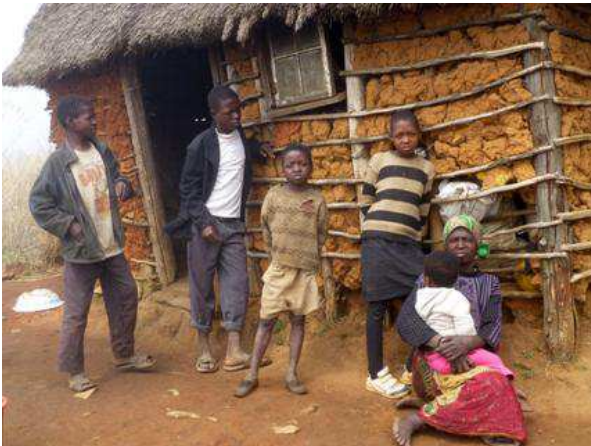
Grandmother and her 5 grandchildren, which are all orphans.