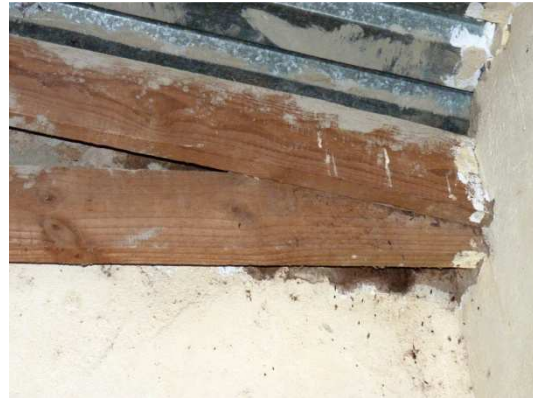
Filth of bats

Now the classrooms with their new ceilings look like this: