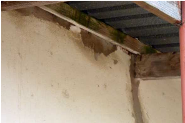
Dampness and mould

The ceilings of the class rooms looked in the beginning like this: