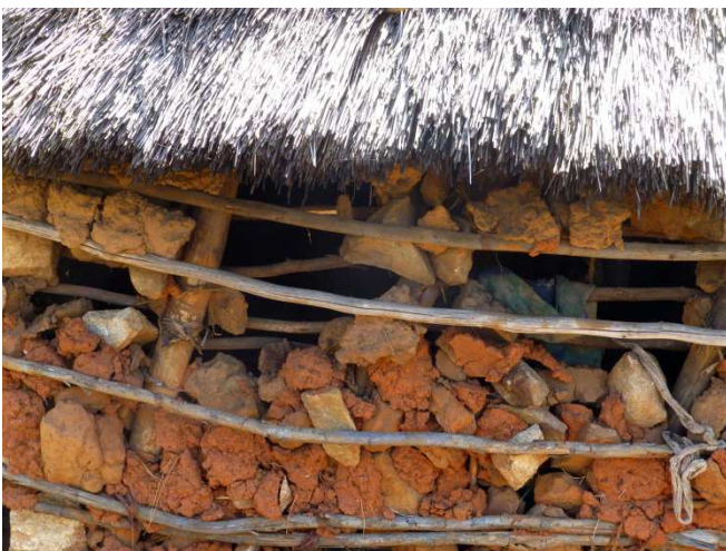
Outside the kitchen