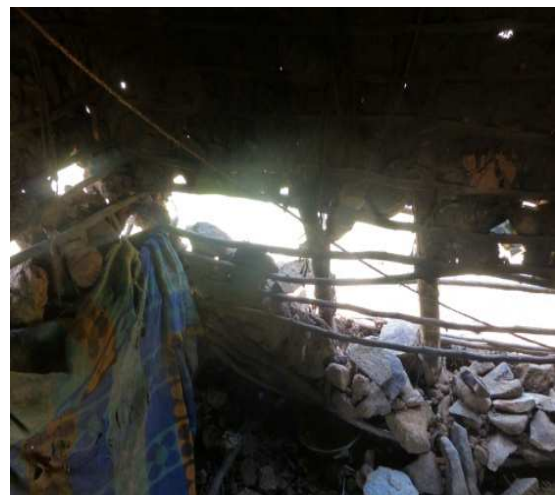
Inside the kitchen

The family consists of five orphan children and the grandmother (2 girls – 12 and 2 years old, 3 boys – 17, 15 and 10 years old). The grandmother is only 57 years old but has the appearance of an 80 year old woman. The children have to work fully for the household and need to find food every day. The way to school is approximately 12,5km and mostly the children have to walk this way with a hungry belly. When it is going well the children can get a warm lunch in school, but if the school has no food as well, then they often have nothing to eat all day. The older girl also has to take care of the 2-year old sister three days a week, when the grandmother goes to the market in Manzini and tries to sell her handmade grass mats.